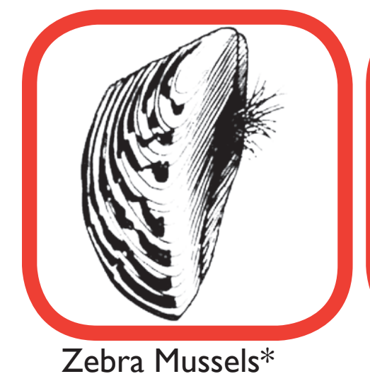
*Dry the boat in a sunny location for at least five days or wash boat with hot water to prevent the spread of zebra mussel larvae.