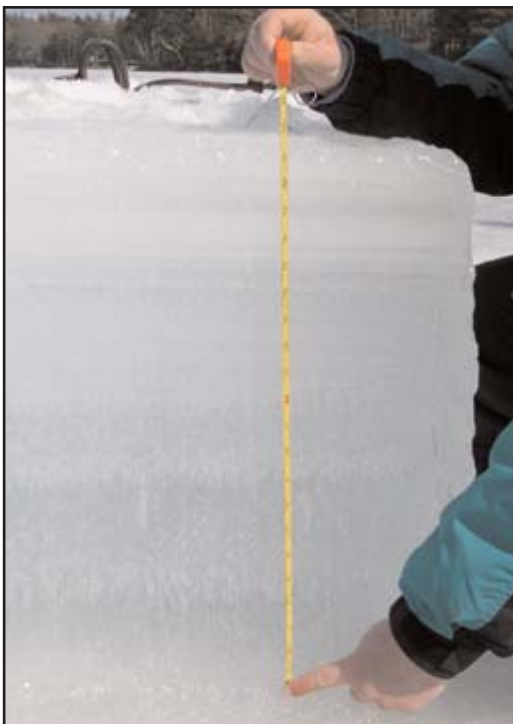
This profile of an ice core taken from Highland lake shows the horizontal stratification lines that were created as the ice formed.

Heat from the metabolism of organic decay, and from sunlight warming the sediments can result in very slow vertical density currents that set up as the warmer water rises and is displaced by