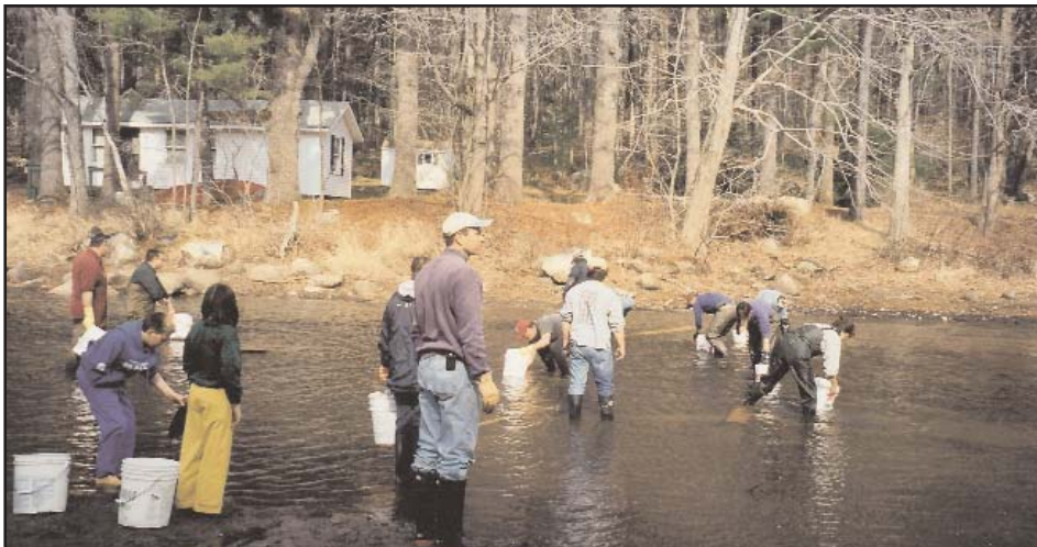
Volunteers wading into Dingley Brook, in Raymond, to remove variable milfoil.

Second, every fragment created during the course of the control project has the potential to cause another infestation, both within the infested lake or--if the proper vector comes along to some other uninfested waterbody. After safety, fragment control should be the number-one consideration of everyone involved in the project. Strategies for controlling fragments include: choosing the proper means to approach the plants, extracting plants with care to minimize breakage, having spotters and skimmers at the surface to gather up stray fragments, and installing fragment barriers