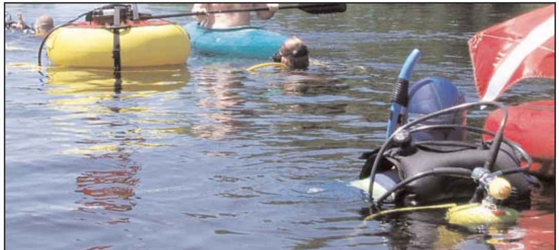
SCUBA divers, divers using a floating hookah system, and spotters in boats at a recent MCIAP training event.

Removing plants causes turbidity; so much of this hand work is done in conditions of poor visibility, compelling divers to learn to recognize the target invaders as much by feel as by sight. The visibility problem can be mitigated somewhat by working methodically in one direction, and striving to keep ahead of the leading edge of the sediment plume. Another solution is to work a defined area, or "plot," until the turbidity becomes