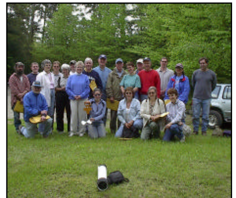
A May 2003 Volunteer Training Workshop