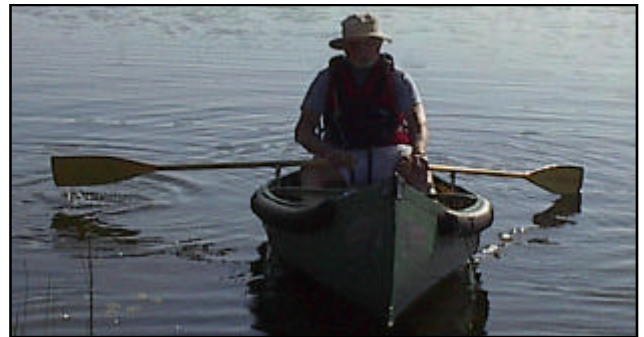
An experienced volunteer plant patroller sets out to survey his assigned shoreline sector.

With summer's green beginning to fade from the leaves and the loons beginning to raft up in anticipation of their fall migration, the end of the 2003 Invasive Plant Patrol season is fast approaching. It has been a wonderful season and we are very pleased to welcome three hundred and fifty new patrollers, from York to Aroostook county, to Maine's plant patrol team. We are happy to report that the number of invasive plants "detected" this year is down considerably from last year. So far there have been only two new sightings: