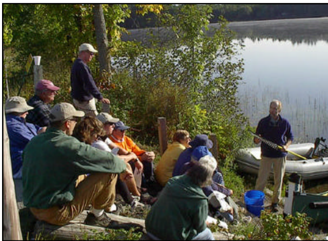
This September, sixteen experienced plant patrollers assembled on the shore of Beals Pond in Turner for advanced field training. Notice the perfect survey conditions - what luck!

Our first "Advanced Screening Survey Field Methods" IPP workshop was a resounding success. The conditions on Beals Pond in Turner were perfect for the occasion—crystal clear September skies, no wind, the surface of the pond was like glass. Sixteen experienced volunteer patrollers had an opportunity to go through all the steps of conducting a screening survey, receive feedback from instructors, and, later to share thoughts, experiences, general ideas and concerns about invasive plants with the group. A TV crew from the PBS Quest program videotaped the activities all morning for their upcoming episode on invasive species. (We will keep you posted regarding the date of the program broadcast.)