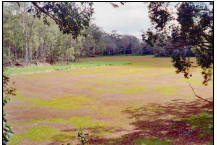
Lake Wilson in Wahiawa, Hawaii, overgrown with Salvinia molesta.

(Salvinia molesta has never been found growing as far north as Maine and, for the time being is not considered a threat in northern climates.)